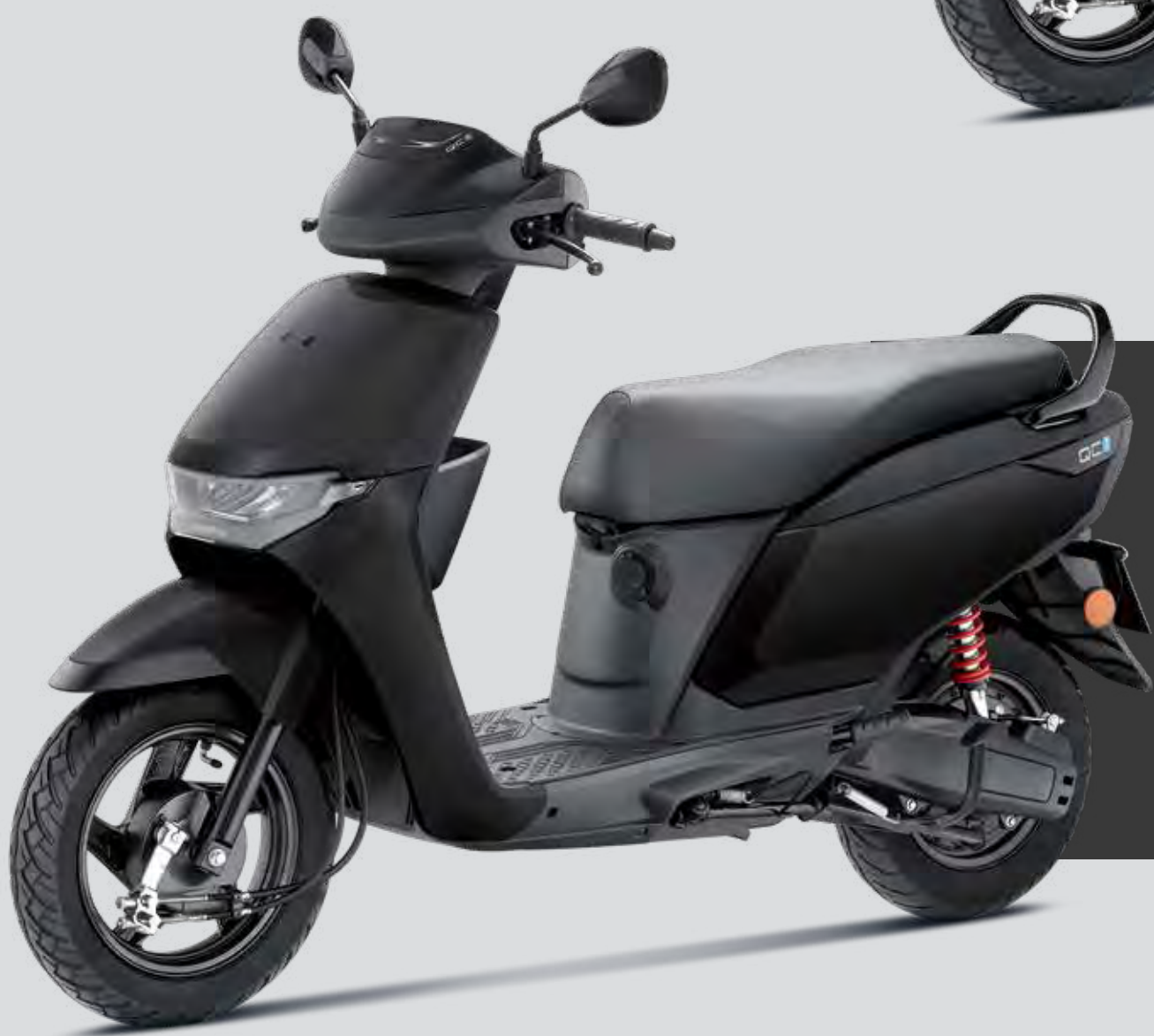
Pearl Igneous Black